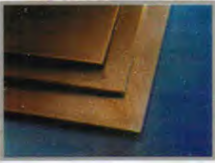
Cut to Size